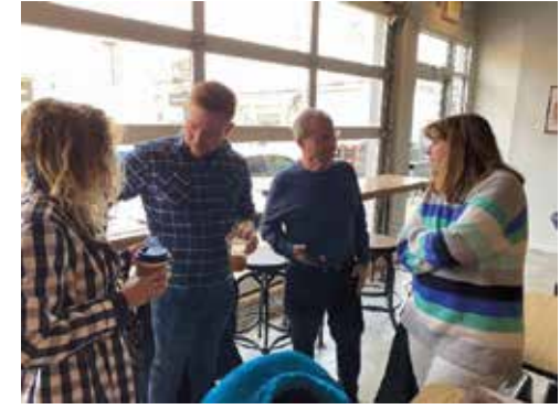
Meet Your Public Officials Event in Coraopolis.