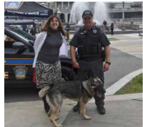
Recognizing working dogs from police and rescue units – as well as their human partners!