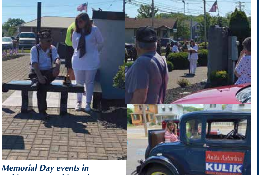
Robinson Township and Coraopolis.