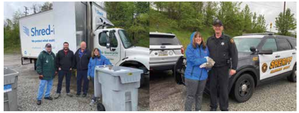
Spring Shred Event.