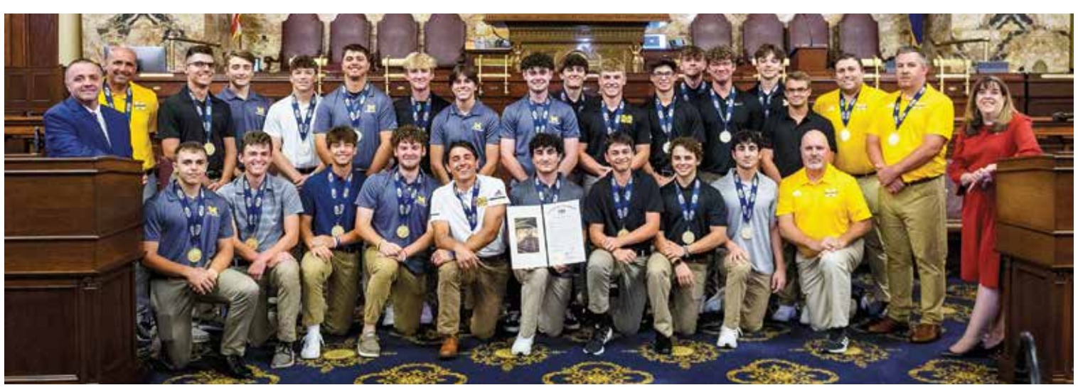
It was great having the 2022 PIAA 4A baseball state champions, the Montour Spartans, honored at the state Capitol in June. Congratulations!