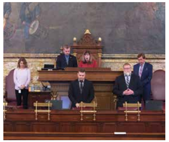
Offering the opening prayer before Session in May.