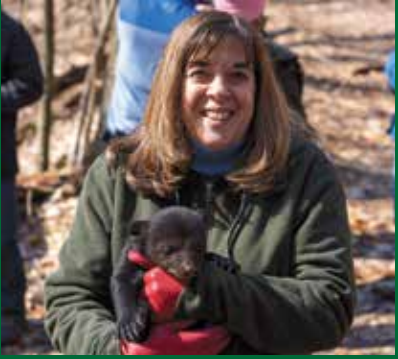
Back in March, I was invited to join officers from the state Game Commission as they tagged young black bears to monitor them and track where they travel.